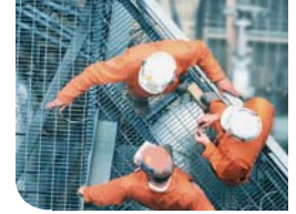
■ Energy & Industry

F24 are the experts for notification and communication in the event of accident, emergency or crisis management. Our FACT24 Notification and Conferencing Service offers highly secure, high-performance and flexible telecommunications solutions to all public and private organisations.